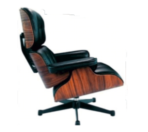
EAMES LOUNGE CHAIR