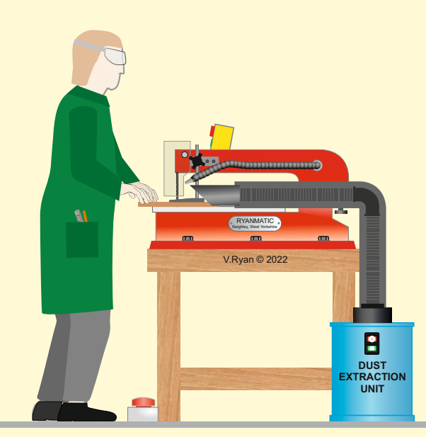
5. FURTHER PRECISION SHAPING BY TRAINED, SKILLED, OPERATIVES