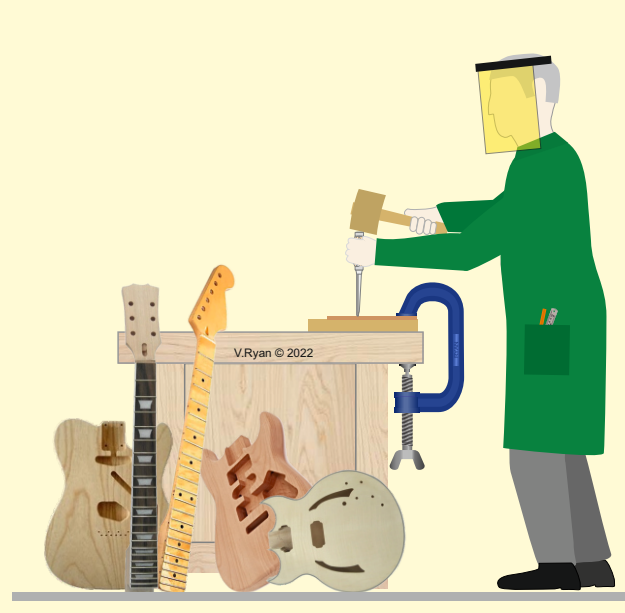
7. ASSEMBLY OF ELECTRONIC CIRCUITS AND OTHER GUITAR PARTS. QUALITY