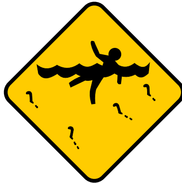
MAN OF WAR

In Hawaii the sea is not only seen as a great resource but also as a place of enjoyment. Tourists visit the islands from all round the world.