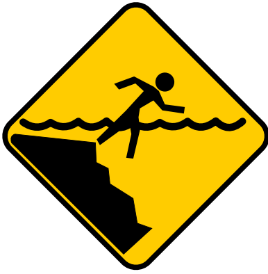
SUDDEN DROP OFF