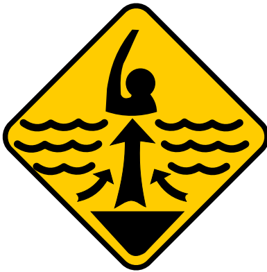
RIP CURRENTS You could be swept out and drown